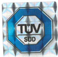
Head of the Certification body